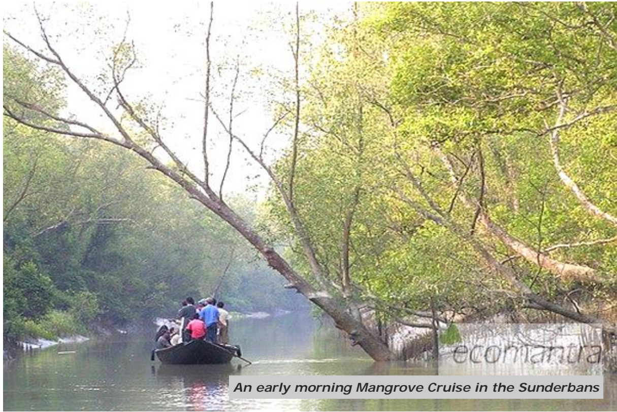
An early morning Mangrove Cruise in the Sunderbans

E comantra brings you a great holiday with a great wildlife experience at the Sunderbans Jungle Camp at a tempting price!