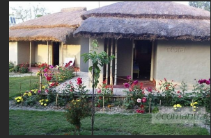
Stay in Traditional Cottages

Sunderbans must be visited not only for the quality wildlife experience but its landscapes are stunning too!