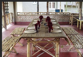
The Dining at Sunderbans

The well appointed traditional cottages are quite comfortable after an adventurous day at Sunderbans.