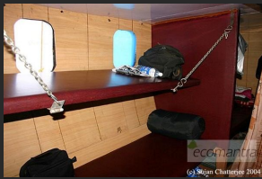
Inside View of the Cottage

The cabins of the Sunderban Cruise Boat are quite spacious for a long journey and cruises