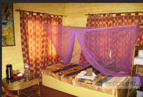
Inside View of the Cottage

The ethnic cottages at Sunderbans are beautifully made using traditional architecture and natural materials.